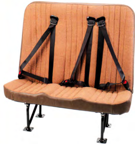
Contoured Activity Seat